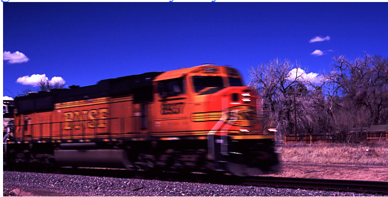
Train on the move

Fountain Creek Regional Park