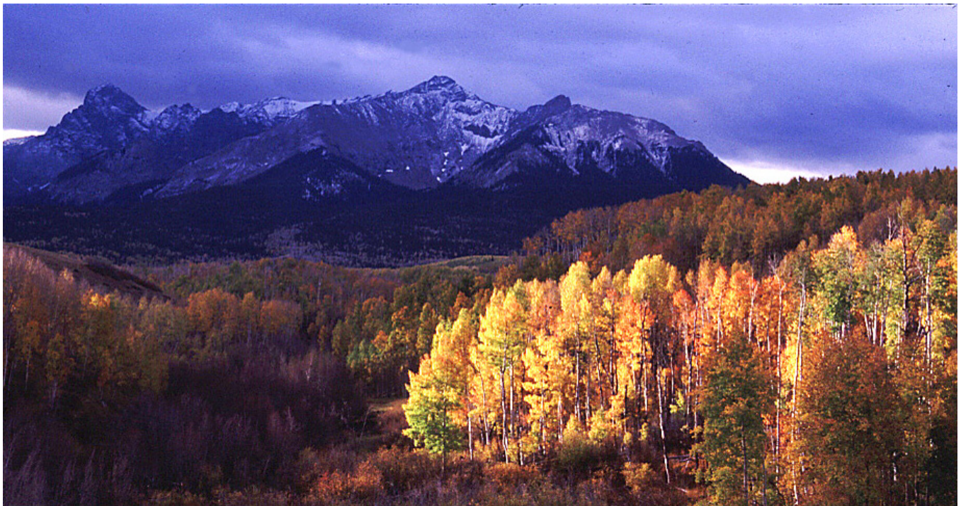
"Spot lit Aspens" by Tom Moldenhauer