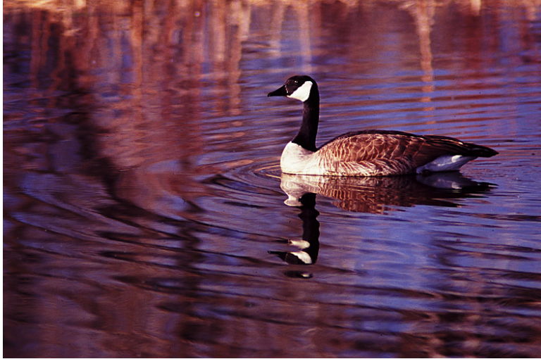
Goose on the water