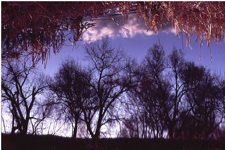
An Optical Illusion