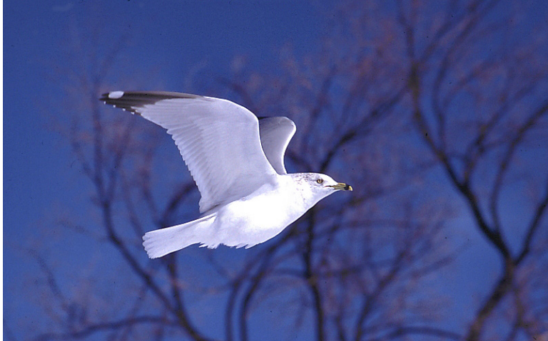
"Sea Gull in Flight" by Jerry Moldenhauer