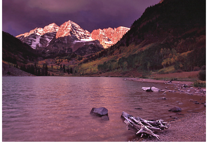
“Early Morning at maroon Bells by Tom Moldenhauer