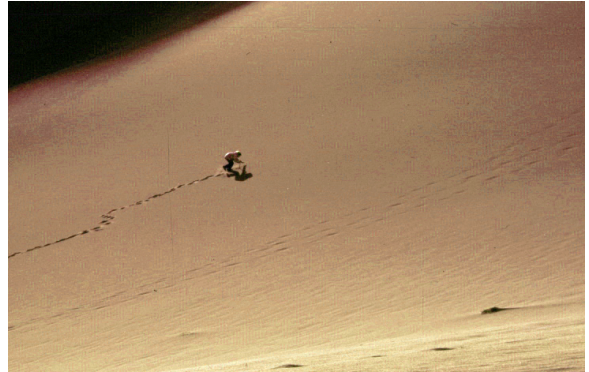
A Little Explorer by Tim Starr