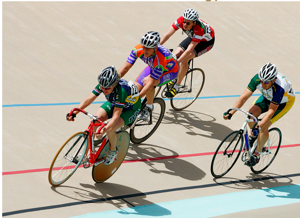
4 Rider Wedge by Bruce du Fresne