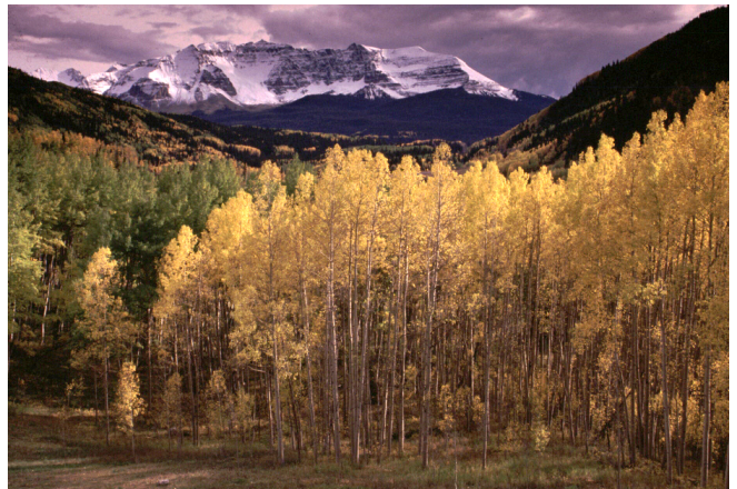
Fall Color near Ophir