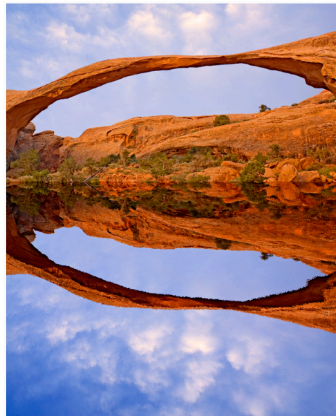
Arch Reflection by Tim Starr