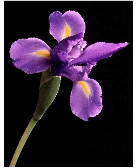
Iris by T.W. Woodruff