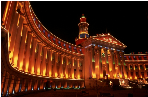
Denver Christmas Lights