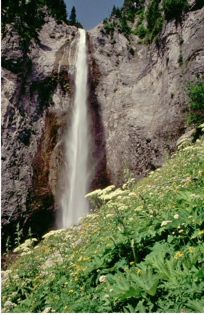
Comet Falls