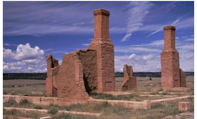
Remains of Fort Union