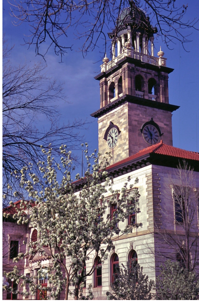
Pioneers Museum by Tim Starr