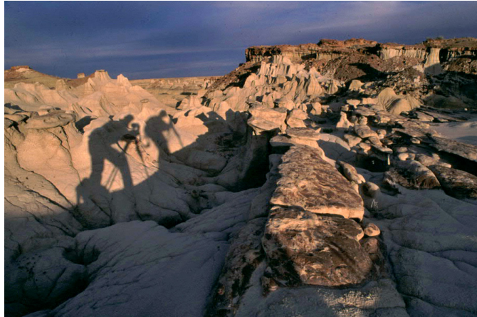
“Photographic Duo”