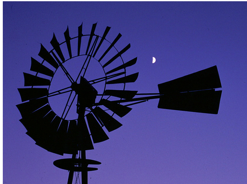
Windmill by Tim

PRINT COMPETITION RESULTS: October 2007: None to report due to the fall scavenger hunt.