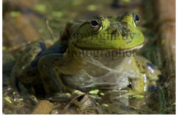
Frog by Bruce du Fresne