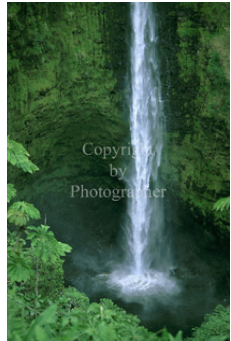
Rain Forest Spigot by Tim Starr