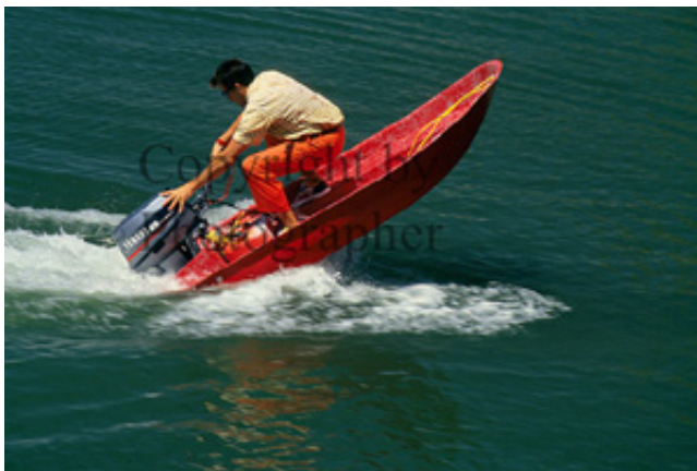
How do you stop this thing?

Bryce Canyon Door to Mountains