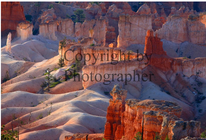
Bryce Canyon by T.W. Woodruff