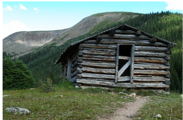
Cabin at Independence