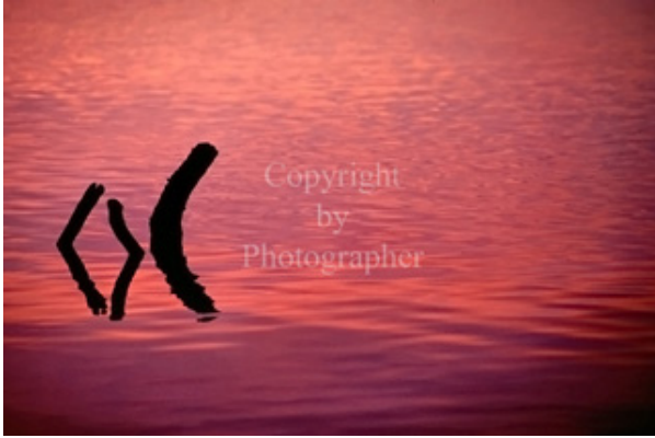
Quiet Pond by Tim Starr