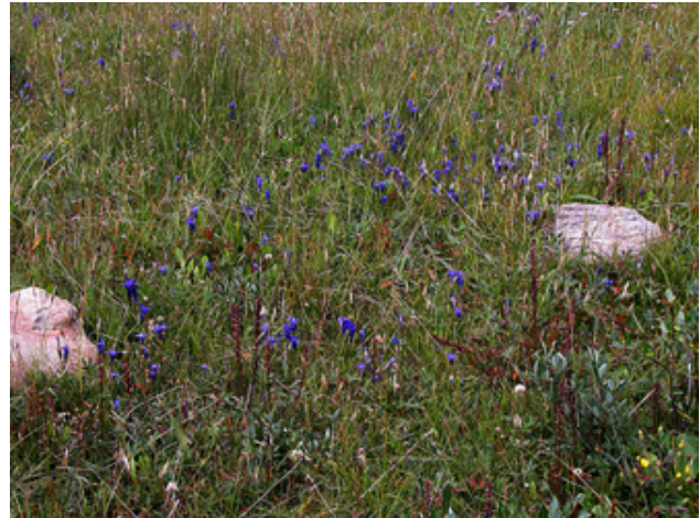
Field of Fringe Gentians (Click and drag to enlarge the photo.)