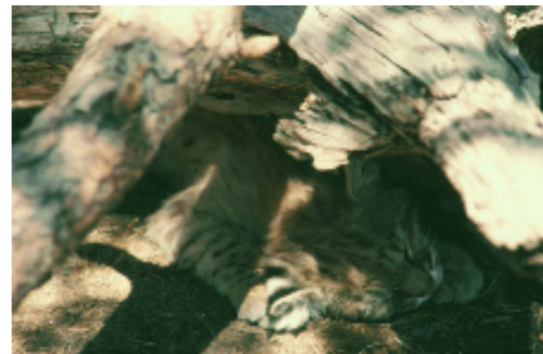
"Bobkat Kitten" Beverly Cellini