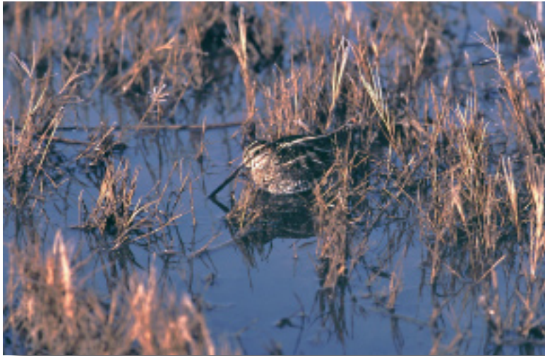
"Common Snipe" T.W. Woodruff