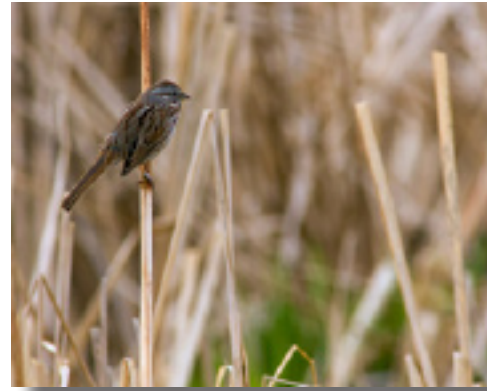
"Sparrow" Bruce du Fresne