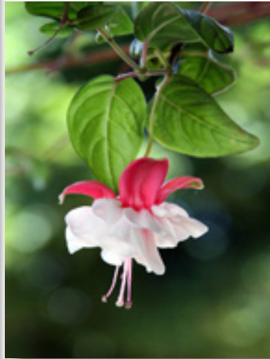
"Open Red & White Flower" Bill Holm