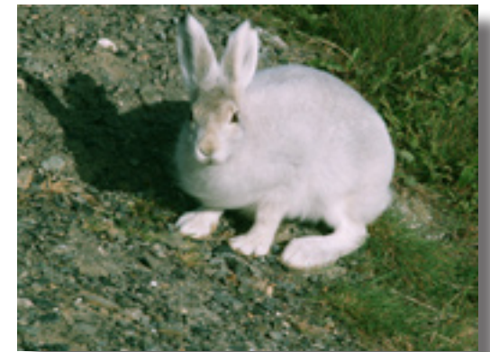
"Oops Wrong Season" Art Porter