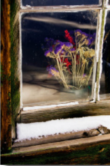
"Open Church Window" Bruce du Fresne