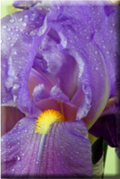
"Iris CloseUp" T.W. Woodruff