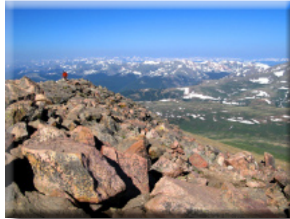
"Top of Bierstadt" Tim Starr