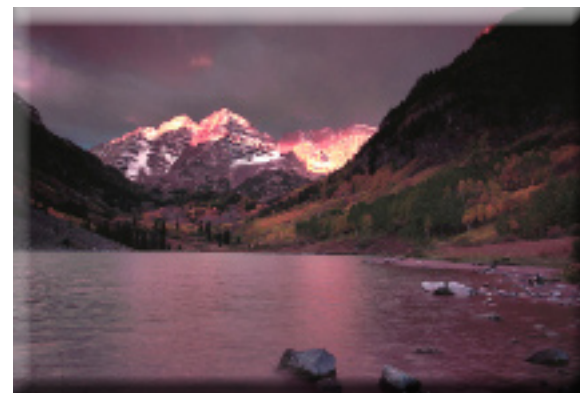
"Morning Glory" Tom Moldenhauer