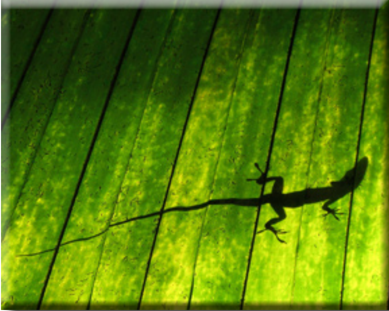
"Lizard" Rita Steinhauer