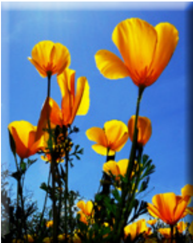
"Ant's Eye View" Bob Card