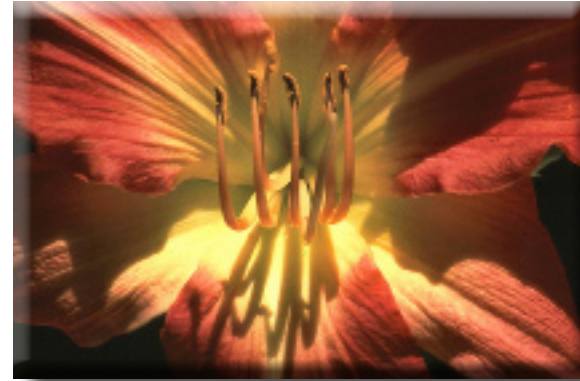
"Flower Power" Andy de Naray