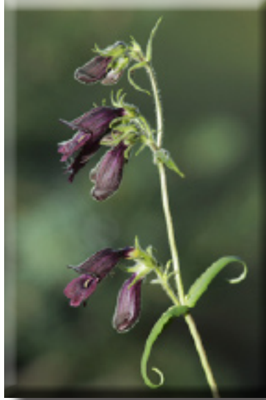
"Dusky Penstemon" Bruce du Fresne