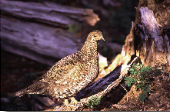
"Grouse in the Woods"