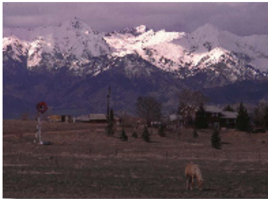
"Ranch Below Blanca Peak" William Stewart

Nevertheless, no membership is needed to be an active viewer of 24 \times 7 = 168 new images per month. A world of wonderful images and inspiration is always available to study and admire. It's only 4 clicks away!