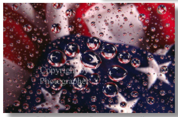
"Flags in Drops"- T.W Woodruff 2nd Place - Open Category 2007 Salon