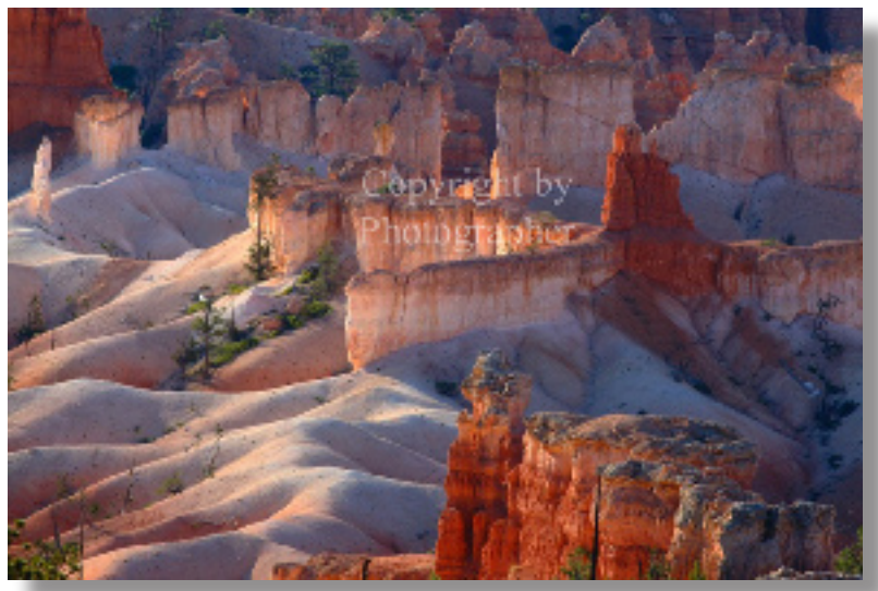
"Bryce Canyon" - T.W. Woodruff Winner - 2007 Salon