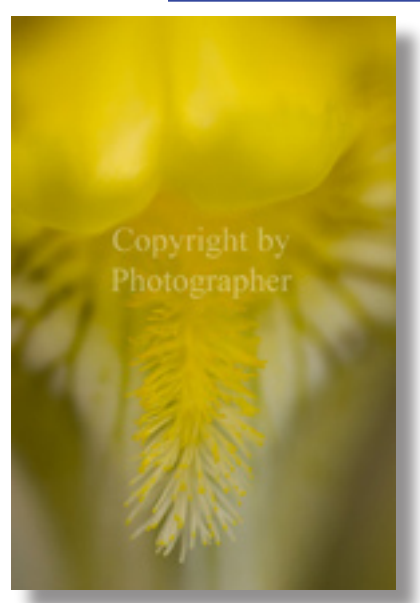
"Yellow Beard" - Deb James Honorable Mention - Digital 2007 Salon