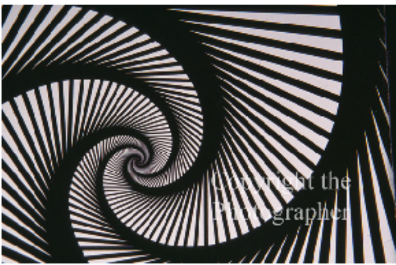
"Spiral" - Winner Open Category - 2007 Salon T.W. Woodruff