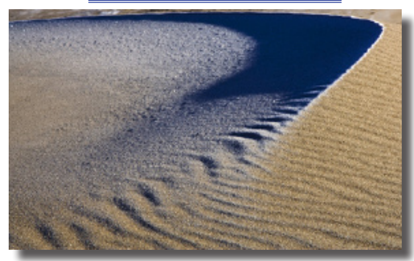
"Dune Crescent" Bruce du Fresne