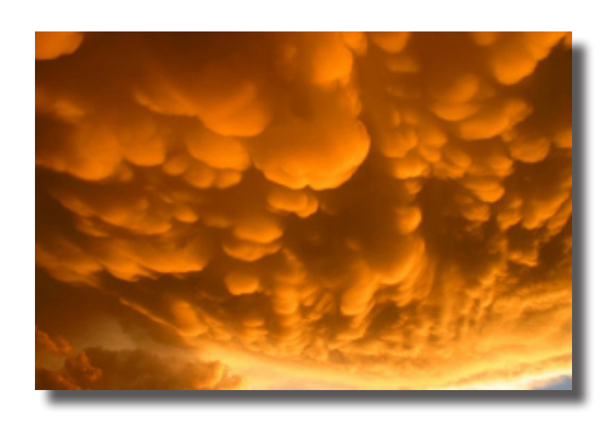
"Cotton Balls" Al Swanson