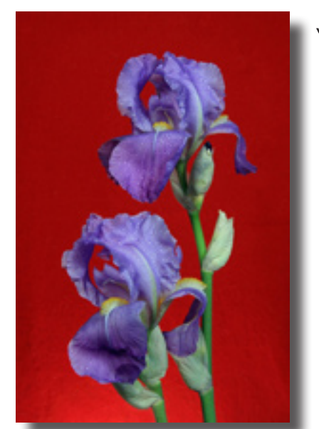
"Blue Iris on Red" T.W. Woodruff