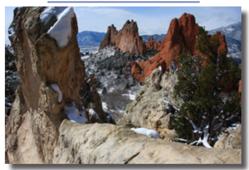
"Garden of the Gods" T.W. Woodruff