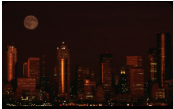
"Seattle Skyline and Moon" Carol Meisenheimer