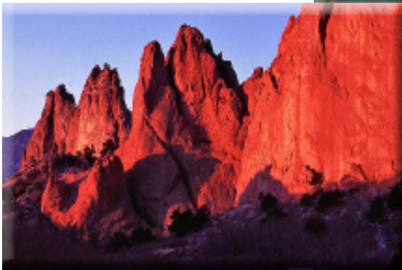
"Untitled" Tim Starr