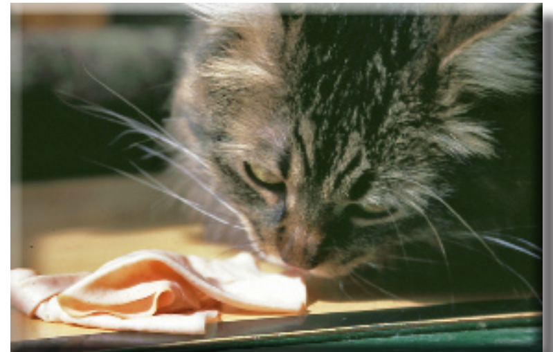
"Untitled" Tim Starr