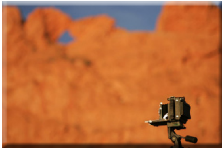
"Old Camera" Bruce du Fresne