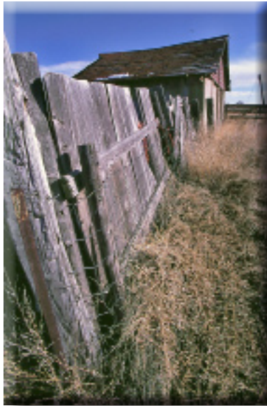
"Untitled" Tim Starr