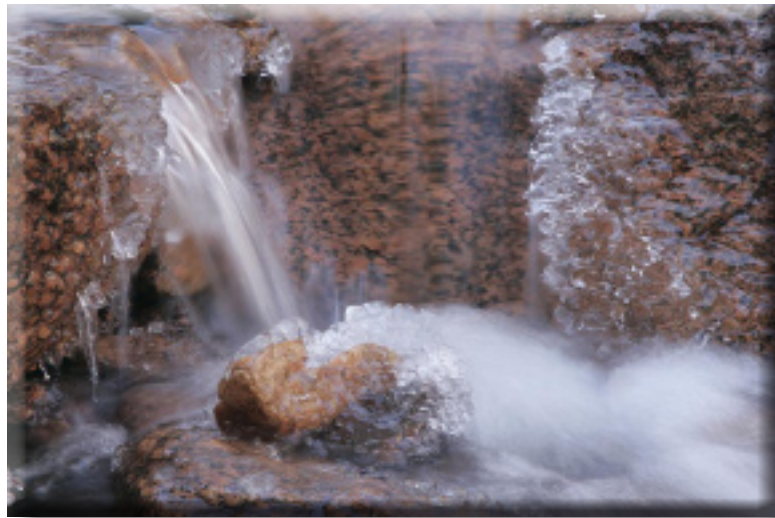
"Water, Ice and Rocks" Bruce du Fresne