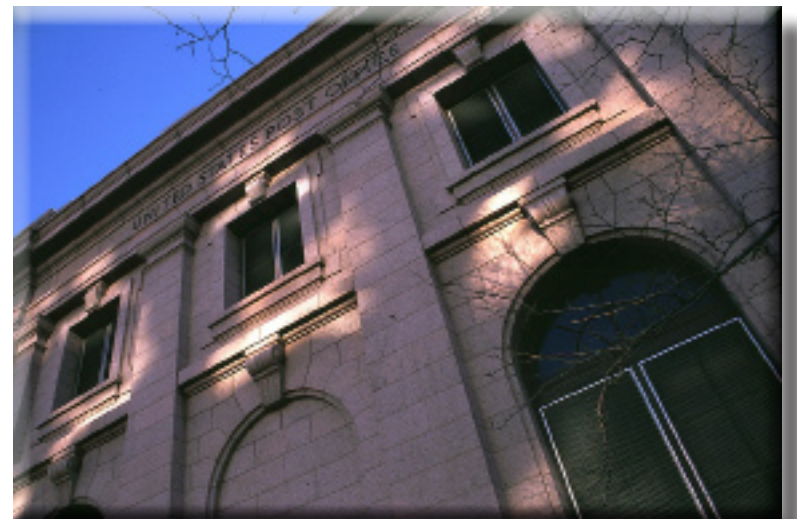
"Untitled" Tim Starr