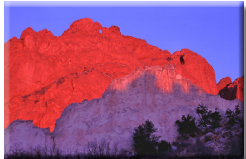
"Untitled" Tim Starr