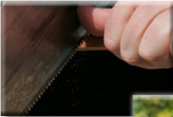
"Saw in Action" Bruce du Fresne