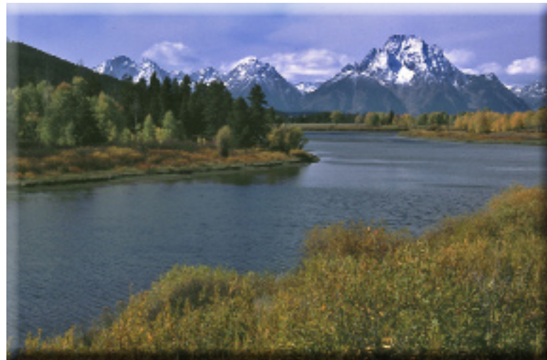
"Oxbow Bend" Tom Moldenhauer