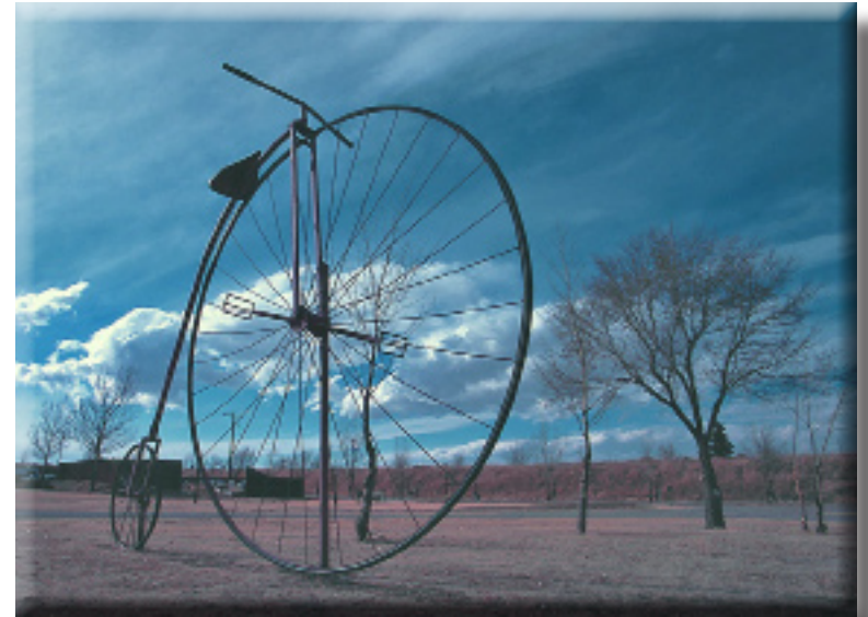
"Untitled" Tim Starr