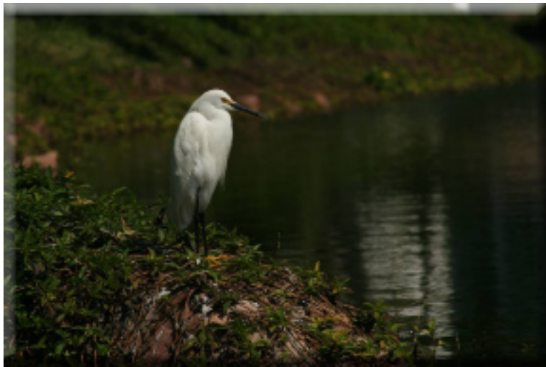
"Snowy Egret Watching" Bill Holm