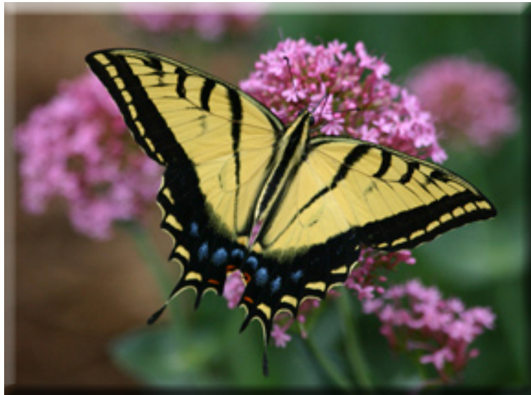
"Swallowtail" Ramona Boone