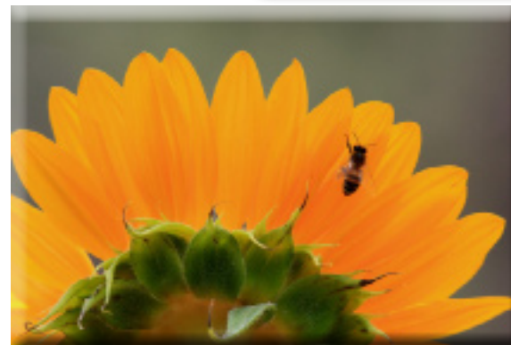
"Bee on Sunflower" T.W. Woodruff