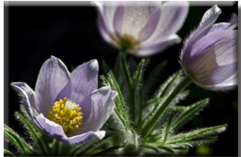
"Pasque Flower" Bruce du Fresne