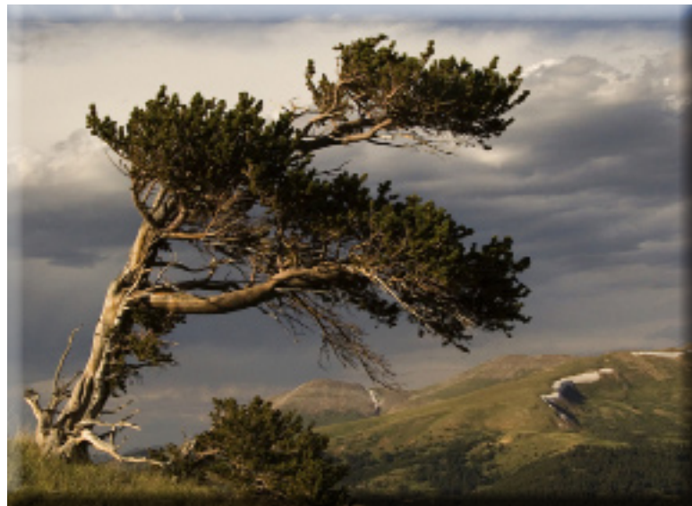
"Wind Blown Beauty" - Jerry Moldenhauer