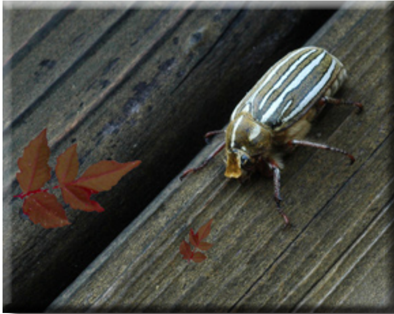
"Beetle Breakfast" - Marjorie Card