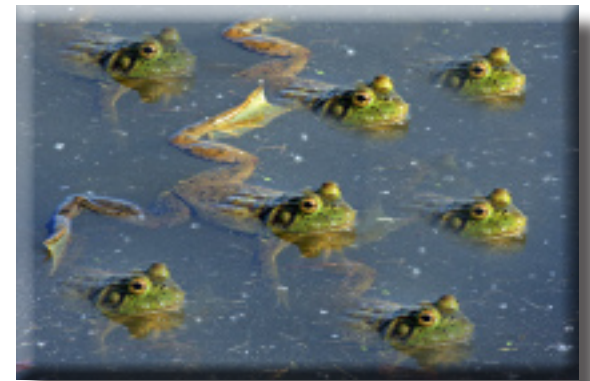
"Seven Frogs" T.W. Woodruff