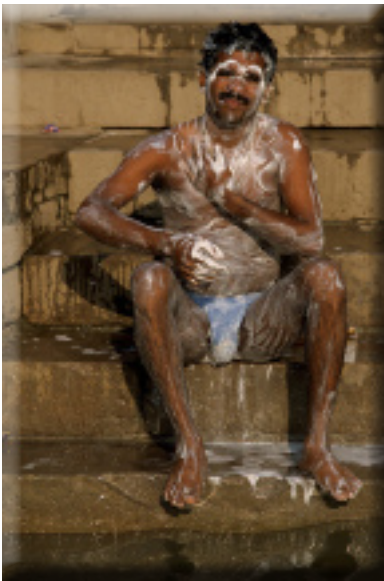
"Lathered Up at Ganges"