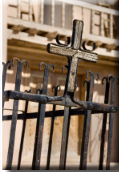
"Wooden Cross" Tim Starr