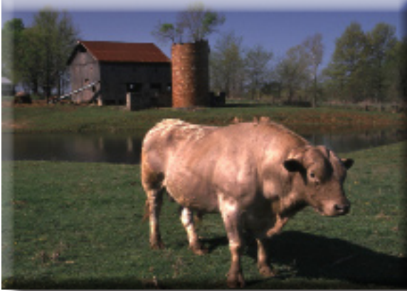
"A Bull in Illinois"