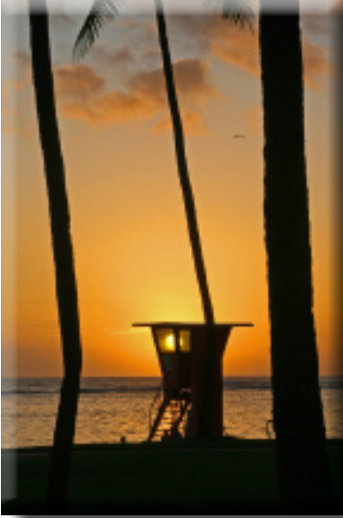
"Sunset Tower"