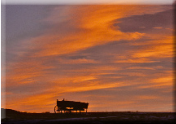
"Into the Sunset"