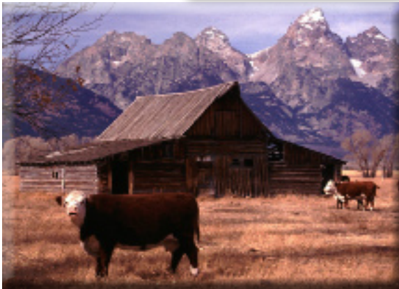
"Mooring at Moulton Barn"