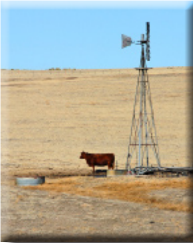
"Where is my Drinkin' Buddies" Sherwood Cherry