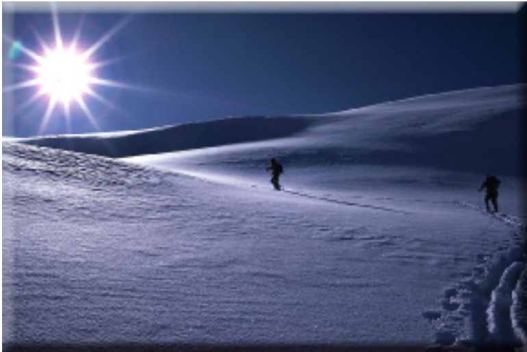
"First Tracks" Spencer Swanger