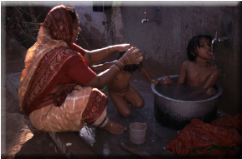
"Bath Time in India"