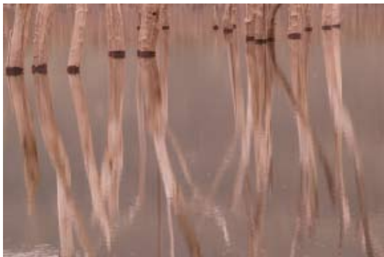
"Water Dance" Art Porter