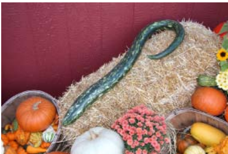
"Market Friend or Foe" Al Swanson