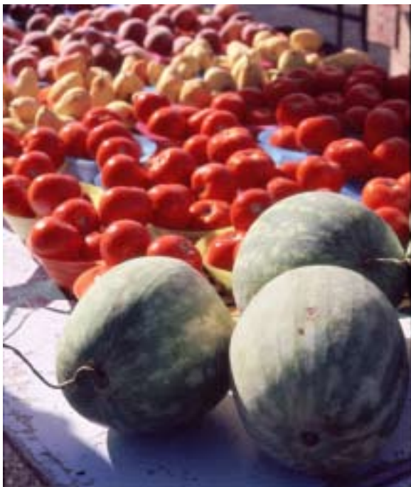
"Three Fine Melons"