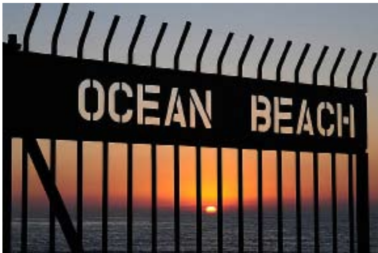
"Ocean Beach Sunset" by Nancy Ellis