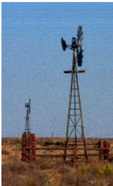
"Windmills on Canvas"