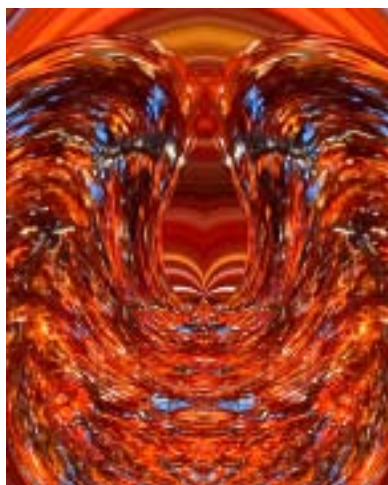
"A Fair Exchange"