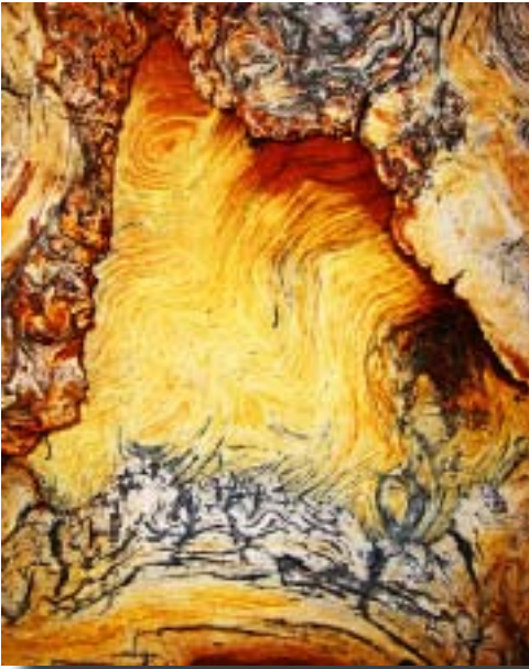
"Wood Patterns - Sierra"