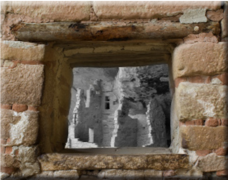
"Looking Through Time" Tim Starr