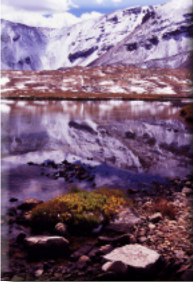
"Alpine Reflection" Jerry Moldenhauer