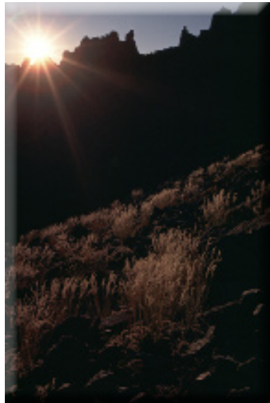
"Last Light" Spencer Swanger 1st Place - Open Slide