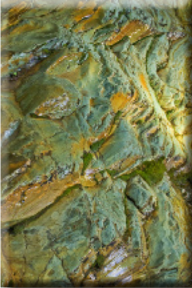
"Green & Gold" - Bruce du Fresne Abstract Award