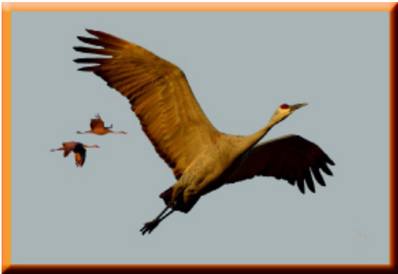
"Sand Hill Crane in Flight!" 2nd Place - Digital Open Category 2008 Salon