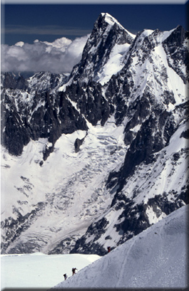
Climbers on the Ridge Spencer Swanger Winner - Open Slide