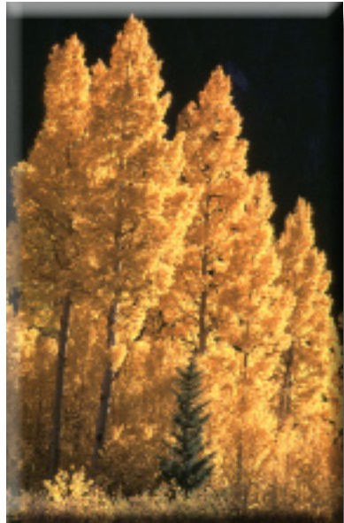
"Untitled" - Spencer Swanger