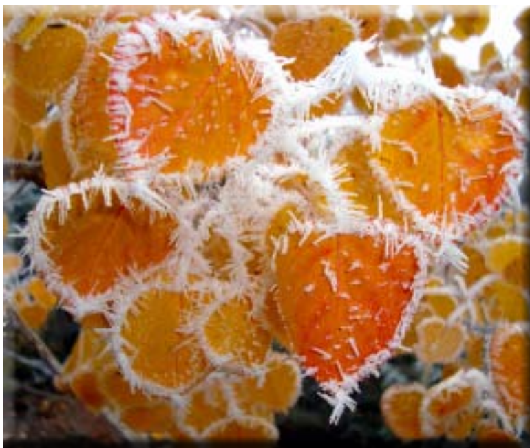
"Frost in Autumn" Spencer Swanger