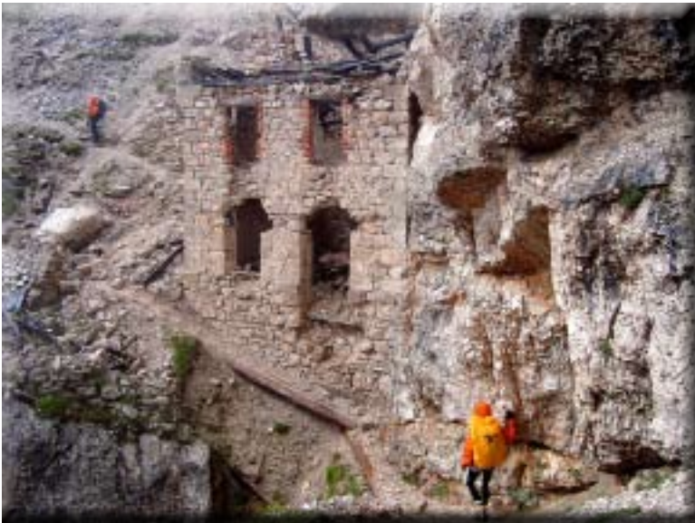
"Relic of War 1917" Spencer Swanger