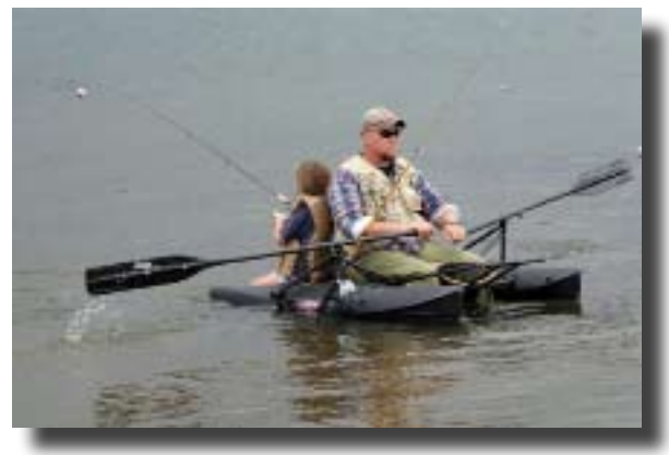
"Dad & Daughter Fishing"