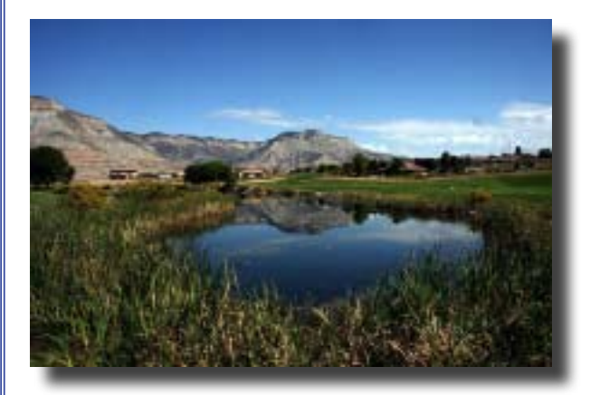
"Pond" Al Swanson