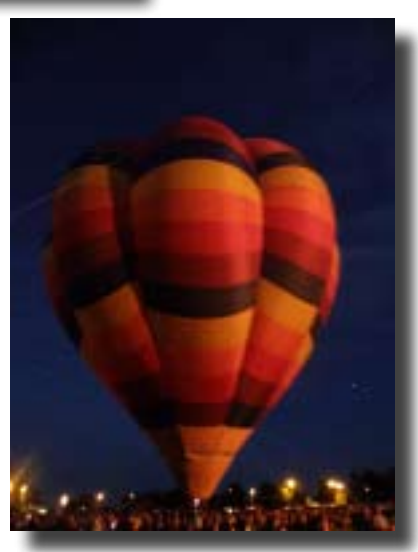
"Balloon at Night" Rita Steinhauer