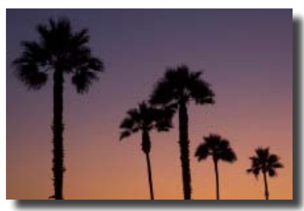
"Palms at Sunset" Bruce du Fresne