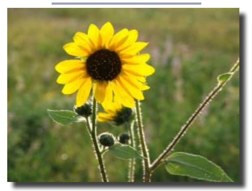
"Backlit Flower" Bill Stanley