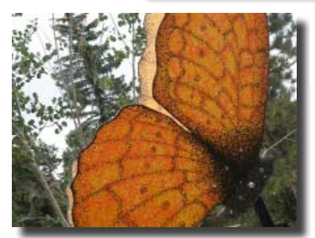
"Big Butterfly" Rita Steinhauer