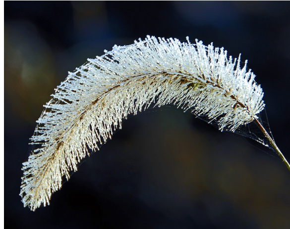
“Frosted Grass” by Sherwood Cherry