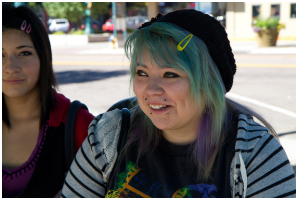
“Pierced” by Galen Short (HM)