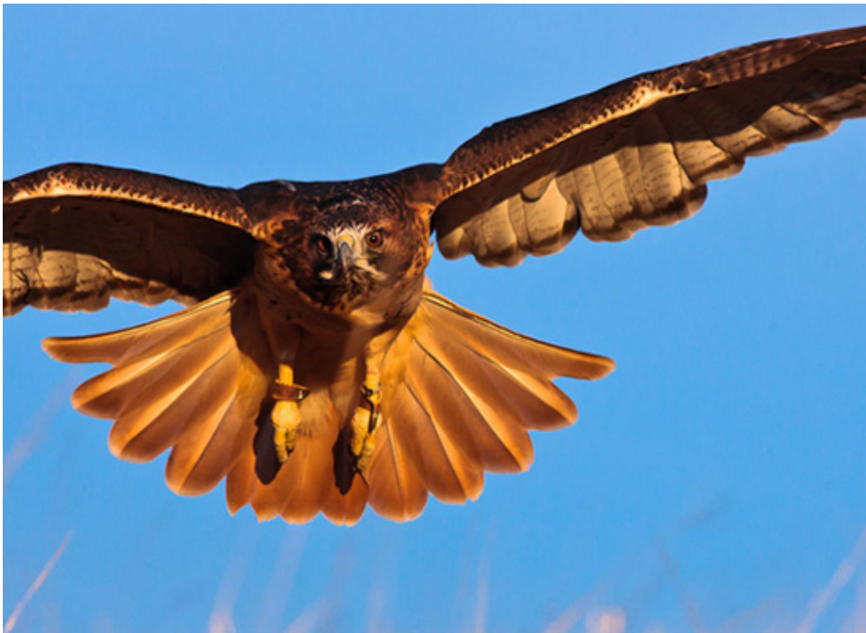
“Red Tail on Approach” by Bruce du Fresne