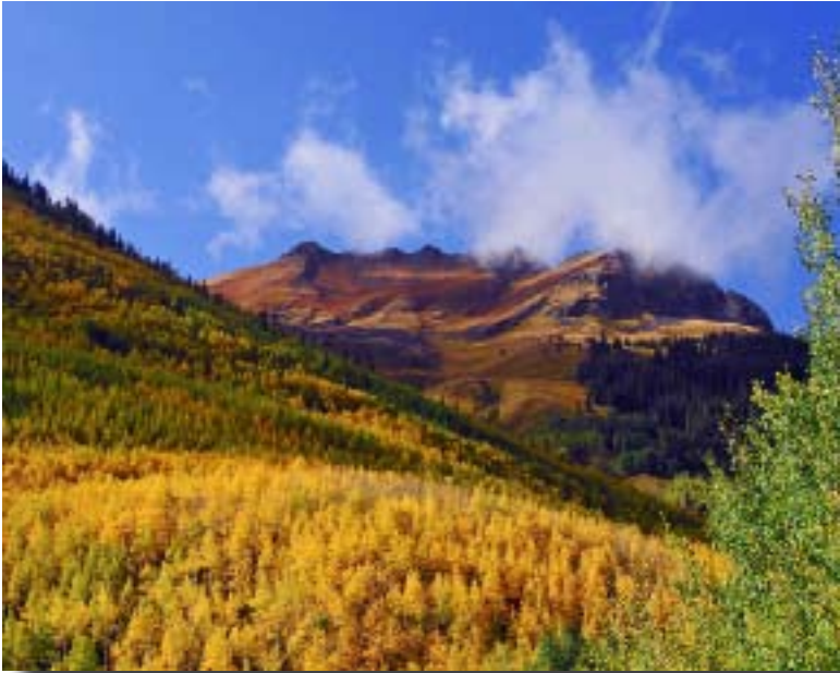
"Million Dollar View" - Sherwood Cherry