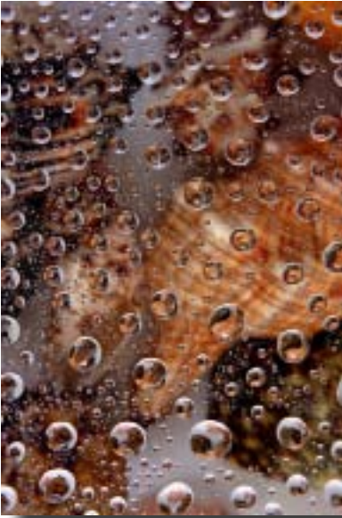
"Shells in Water Drops" TW Woodruff