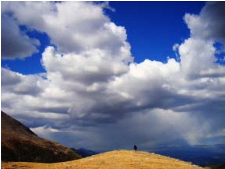
"The Glorious Sky" - Spencer Swanger