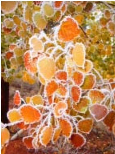
"Frosted Leaves" Spencer Swanger