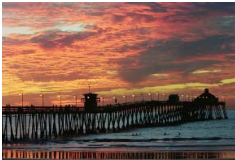
"Imperial Beach Pier" Nancy Ellis