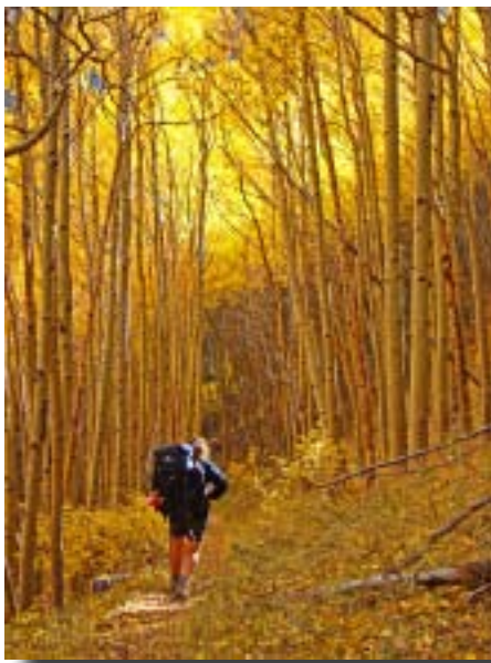
"Golden Hike" Spencer Swanger