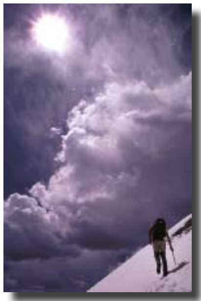
"Mt. Democrat" Spencer Swanger