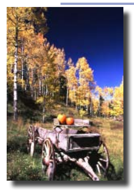
"Retired" Spencer Swanger