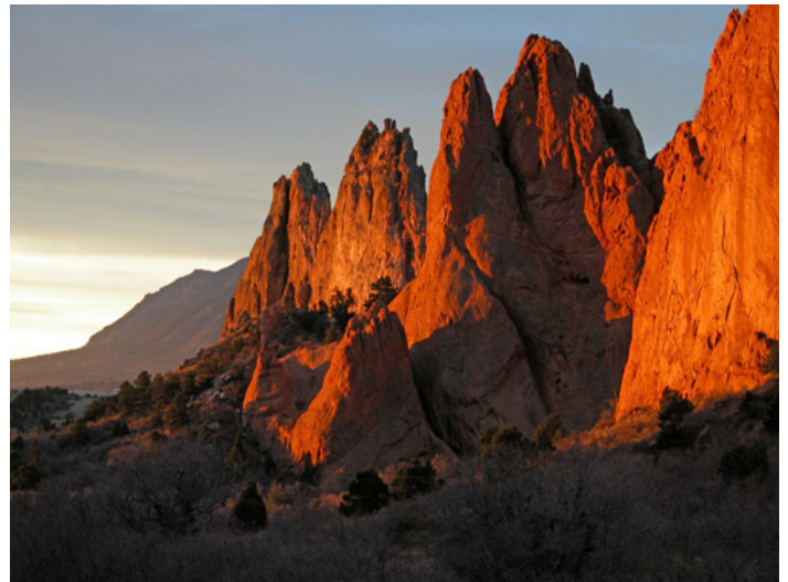
“Garden Morning” by Jerry Moldenhauer