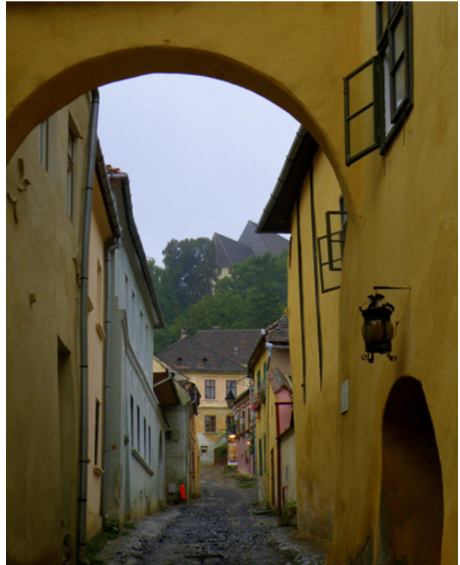
"Romanian Road" by Rita Steinhauer