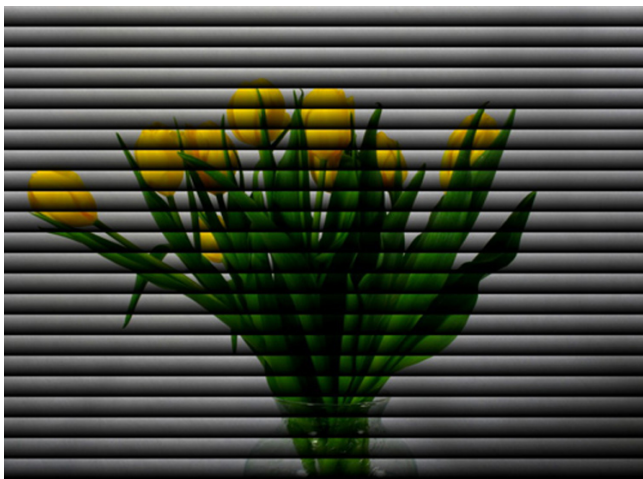
"Yellow Tulips" by T.W. Woodruff