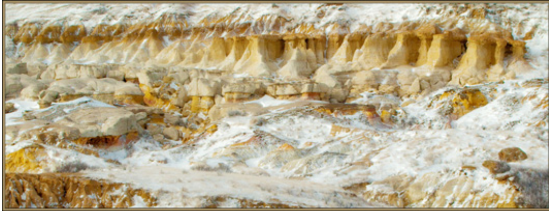
“Paint Mine Pano”