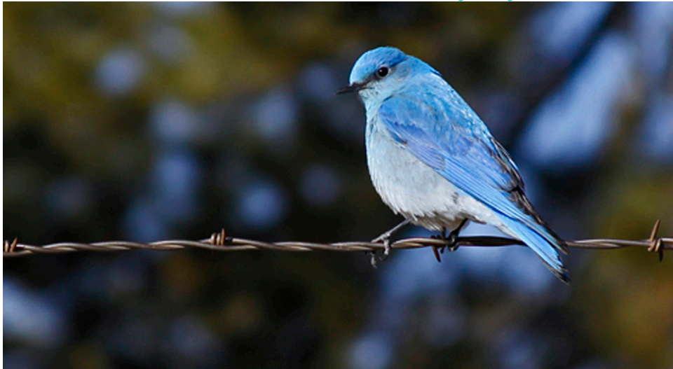
"Blue Bird on a Wire" by Bill Holm