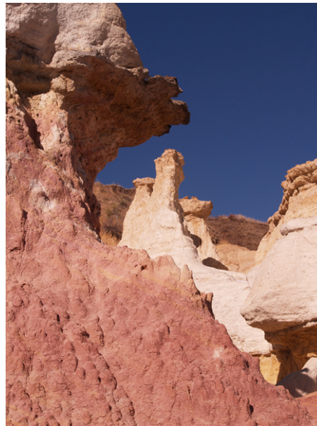
"Red White And Blue" by Art Porter