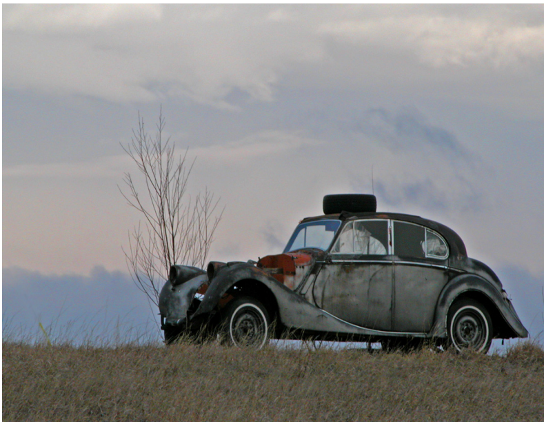
“Old Grey Car” by Jerry Moldenhauer