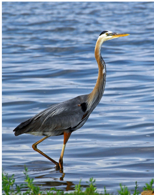
"Blue Heron" by Sherwood Cherry