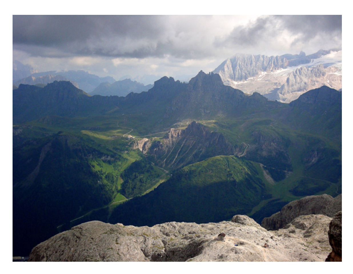
"Mountain Light" by Spencer Swanger