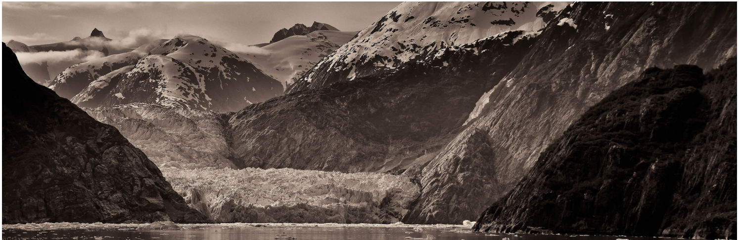
“Tracy Arm Glacier”