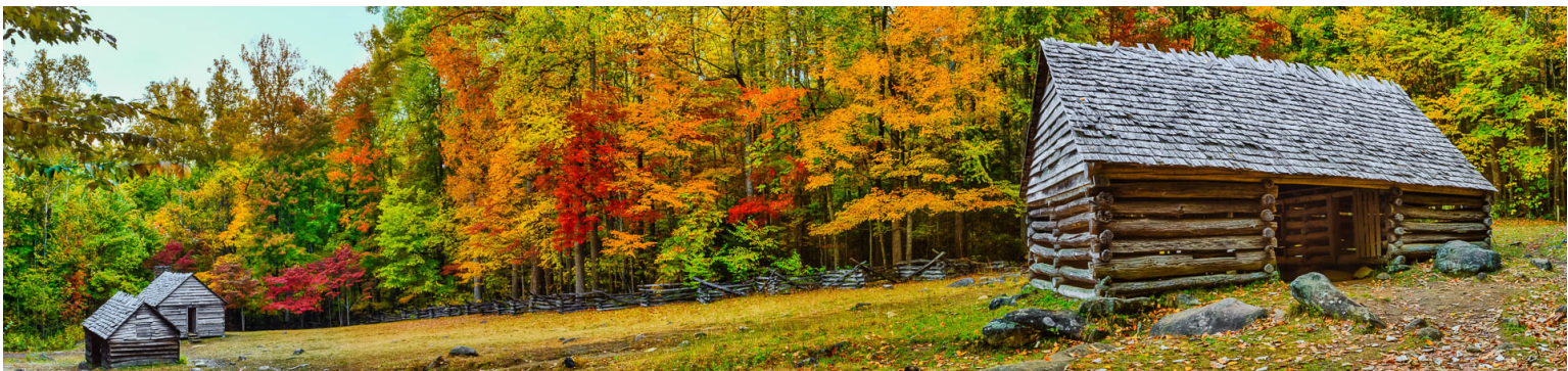
“Appalachian Homestead” by Bruce du Fresne