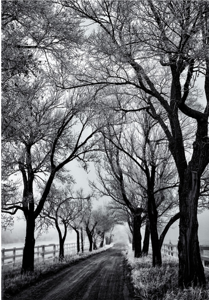
“Foggy Frost” by Tim Starr

I took this on a morning with a heavy frost and lingering fog. I am a big fan of unusual/ bad weather photography! I went out on this trip from my home in Falcon north up through the Black Forest as a specific photo hunting journey. As soon as I saw this scene I had in my mind's eye exactly how I was going to interpret it. Most definitely monochrome! I really enjoy scenes where the lines and repetition lead a viewer into the photograph, and in this case some mystery too. I also thought the patterns in the branches gave it a little bit of extra impact.