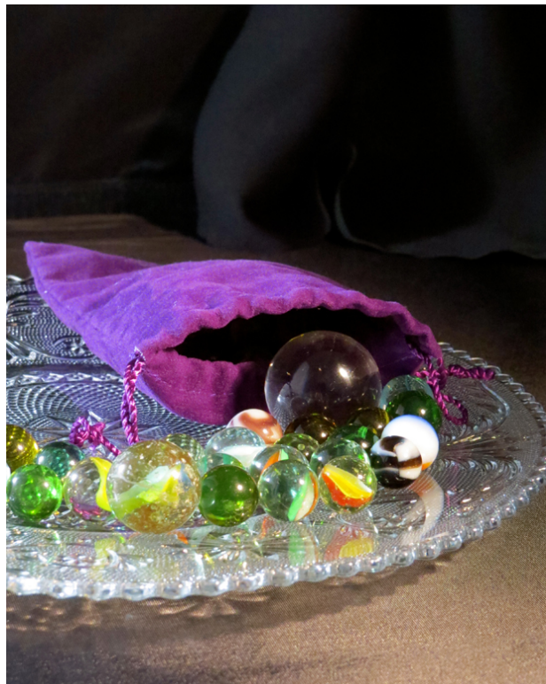
“Marbles” by Rita Steinhauer