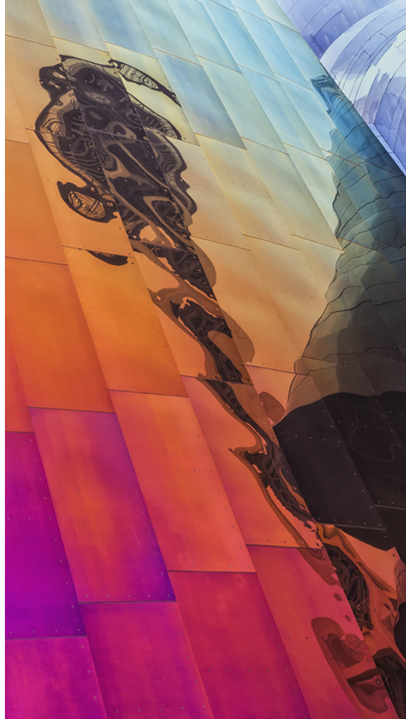
“Seattle Space Needle Wall” by Jim Van Namee

This image was made at the Experience Music Project Museum, a nonprofit museum, dedicated to contemporary popular culture located in the Seattle Center, Washington. I was in the area and noticed how the Space Needle reflection reminded me of how Eskimo paintings depict things they observe. Technical details: Canon Rebel SL1; EF17-40MM USM lens; 40mm focal length; F/8 Aperture; 1/60 Shutter Speed; Aperture Priority; Evaluative Metering.