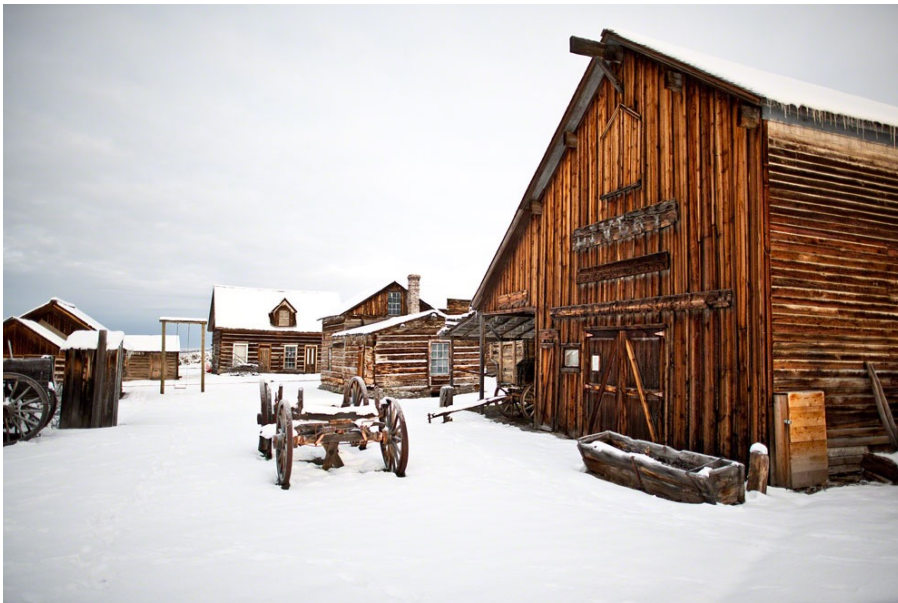
Nevada City, Montana, D3X, AF-S NIKKOR 24mm f/1.4G ED, 1/1500 second, f/1.4, ISO 200, aperture priority, Matrix metering