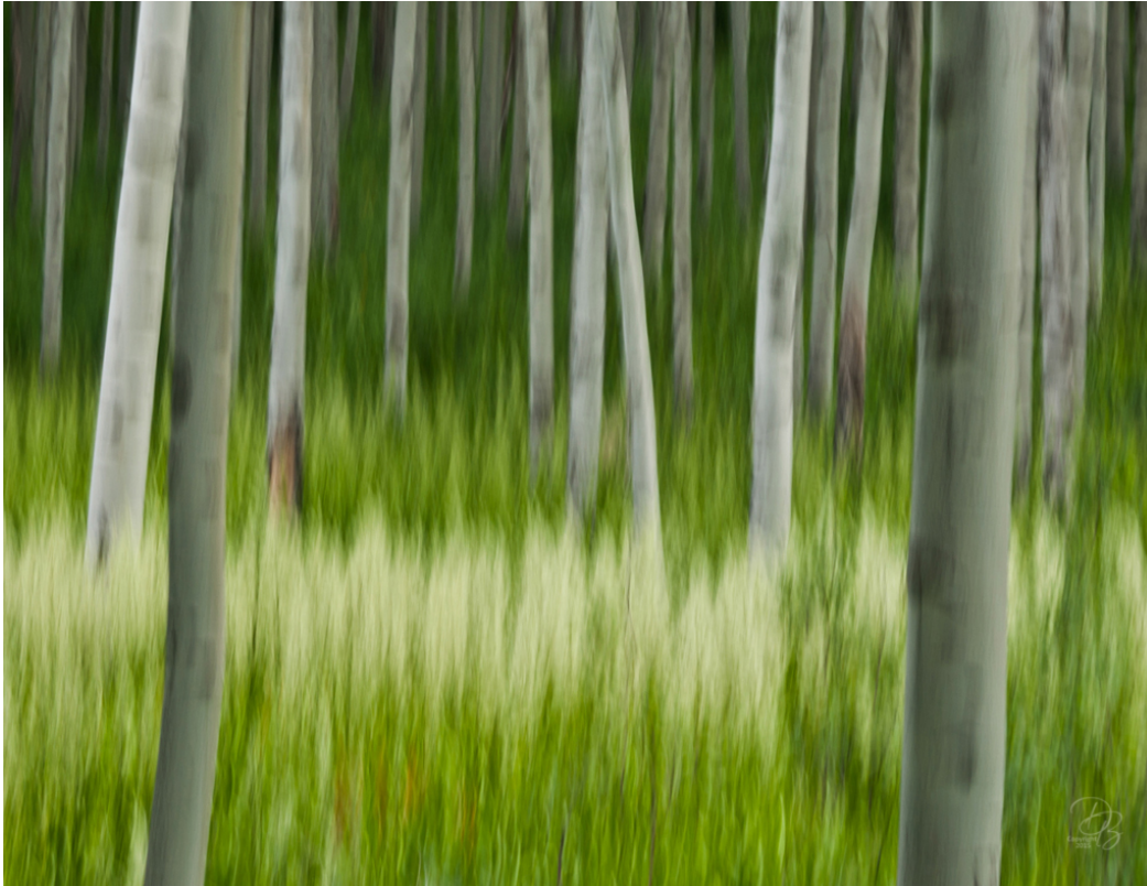
Example of intentional in-camera blur