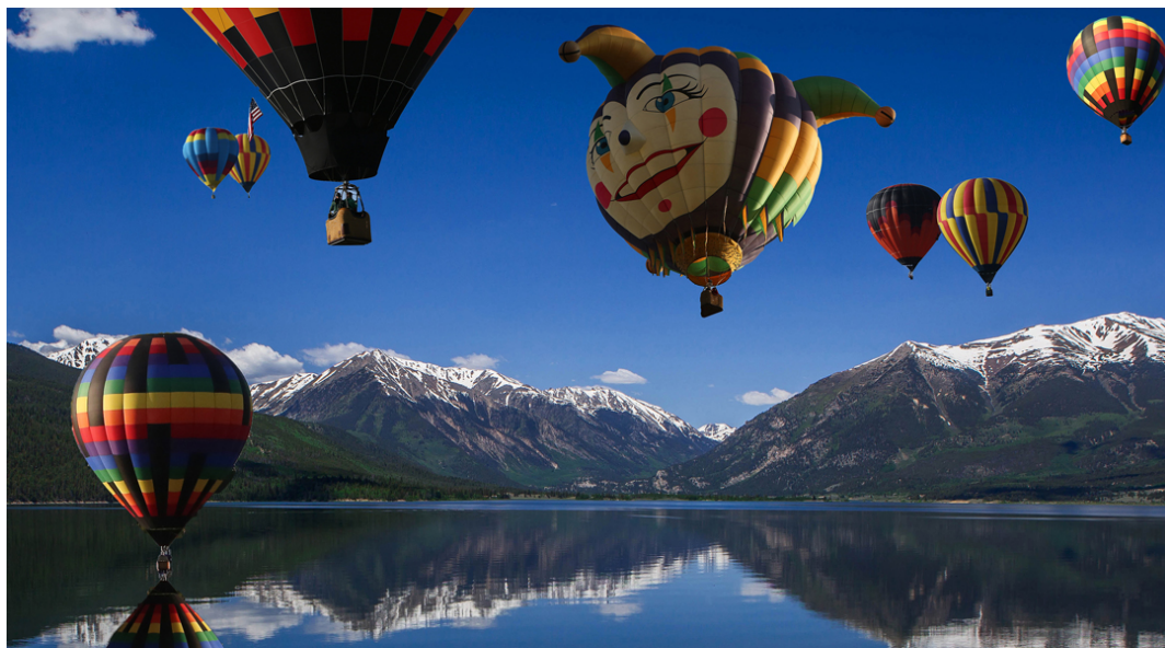
“Up Over Twin Lakes” by Bill Holm