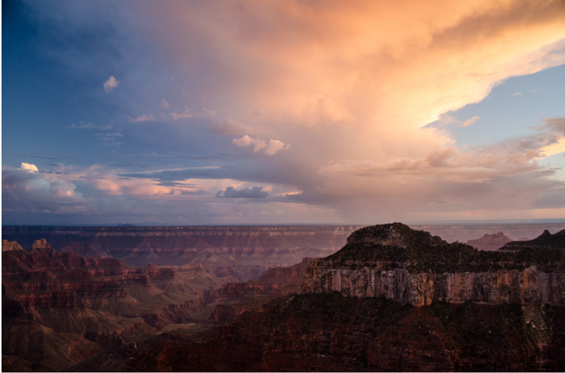
“Grand Sunset” by Liz Stokes

I took this photo at the North Rim of the Grand Canyon at 6:45pm on August 31, 2015. We had gone out to the canyon overlook in front of the North Rim Lodge for sunset. I used my Nikon D5100 with the Nikkor 18-55mm lens at 18 mm. The actual sun setting was to the right of the picture but I thought the light on the cloud formation over the canyon was beautiful.