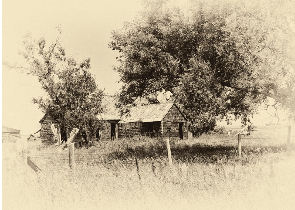
“Homestead in Antique” by Al Swanson