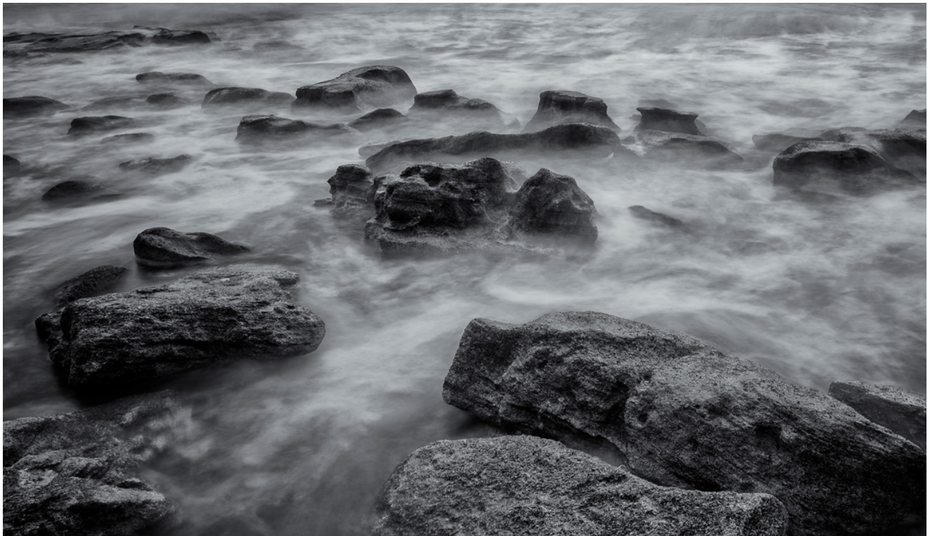
“Seashore” by Tim Starr