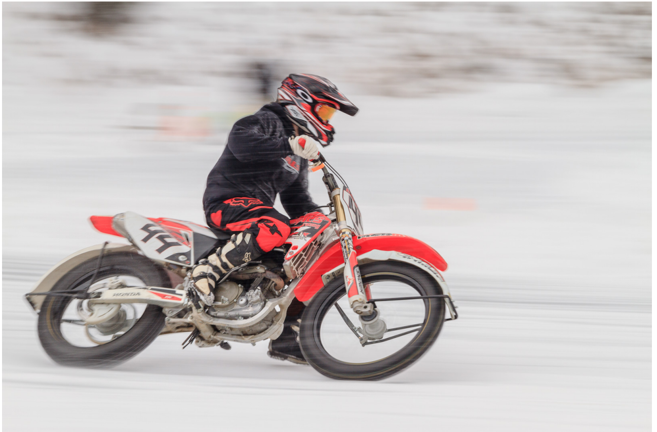
“Speed Racer” by Bruce du Fresne