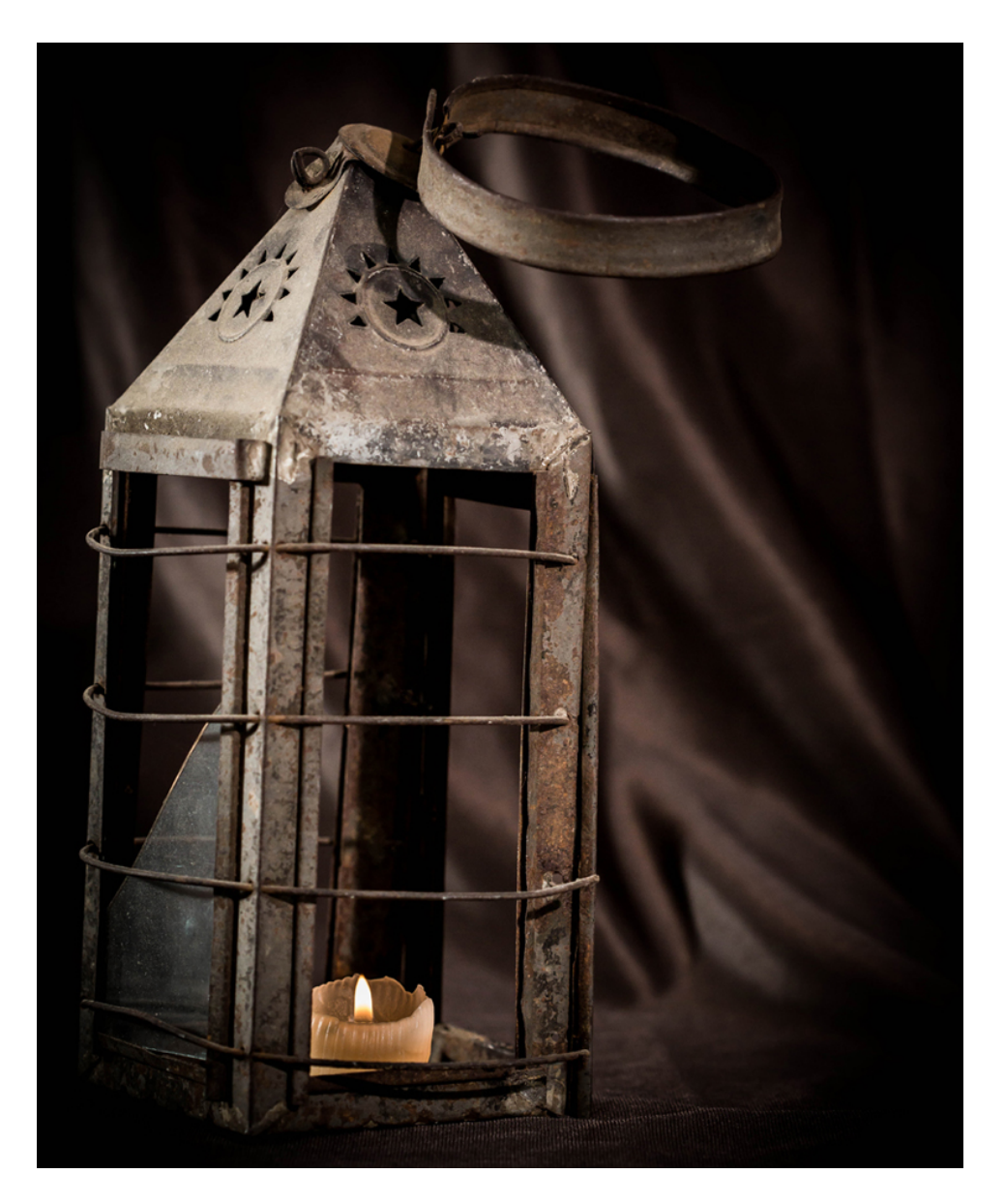
"Light the Way" by Bill Holm