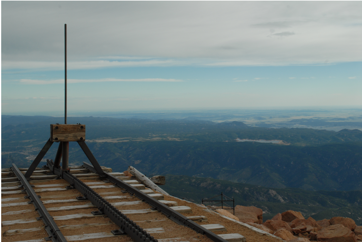
“End of the Line” by Al Schwecke

"The picture was taken 9-1-1997. A slide taken a long time ago. It was one of our early trips to the top of Pikes Peak. With my trusty Nikon F-100 Film camera loaded with fuji Velvia at ASA 100. You remember ASA?? Drove to the top and started snapping like crazy. I was having a good time. I kept looking at the end of the tracks and loved the composition. Played with number of angles and finally settled on this picture. Exposure was 1/125, f8 ASA 100 with a 70 mm lens. I took good notes in the film days so I had the info. Even more luck, I found them. As I was looking for the picture in the computer when I realized this was a picture that was not scanned into the computer. Took the print I had and went to Mike's Camera. They put the picture on a disc and then on to Nancy for the newsletter. Got it done and my panic was over. Too much fun!