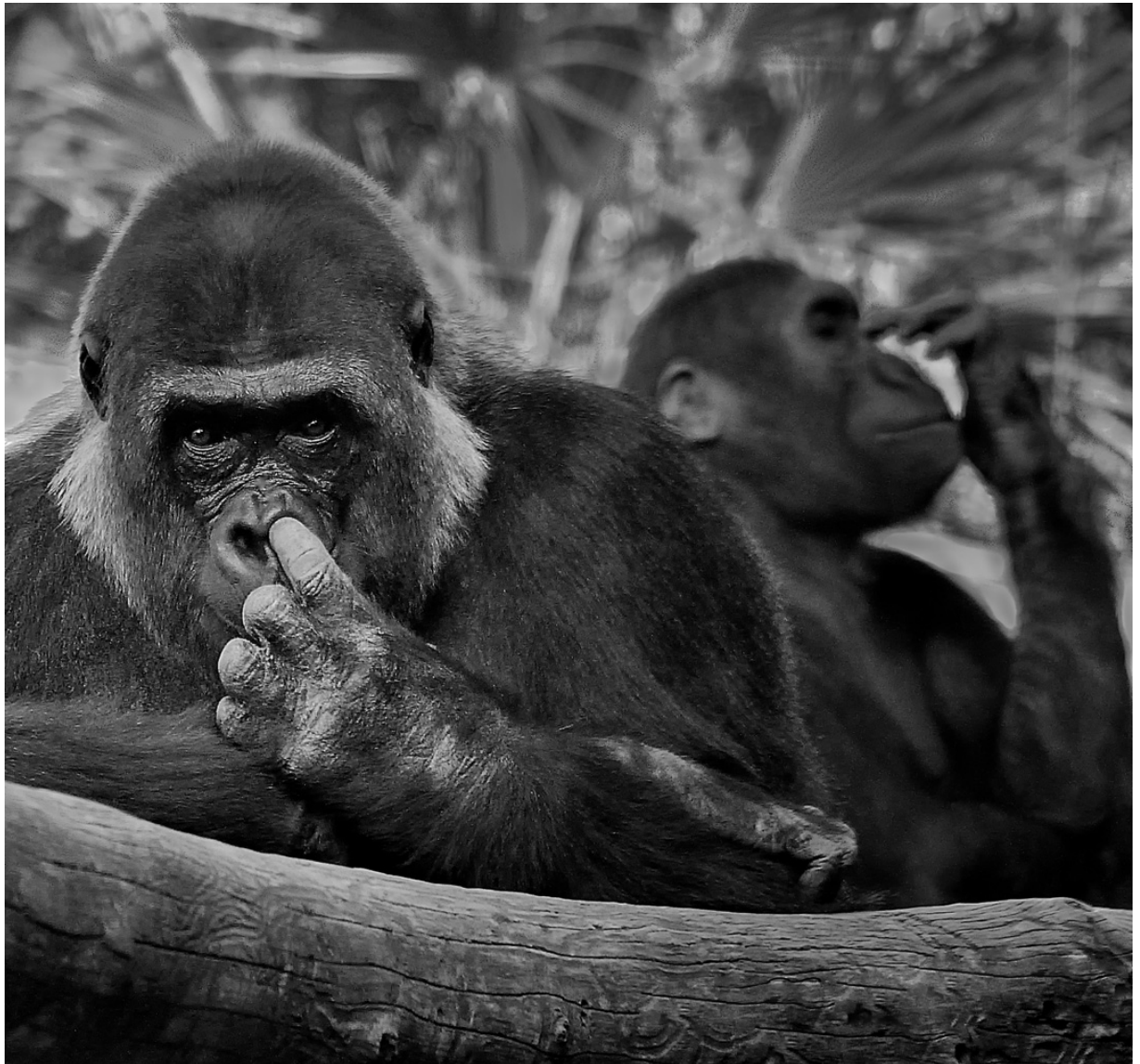
“Snack Time” by Debi Boucher