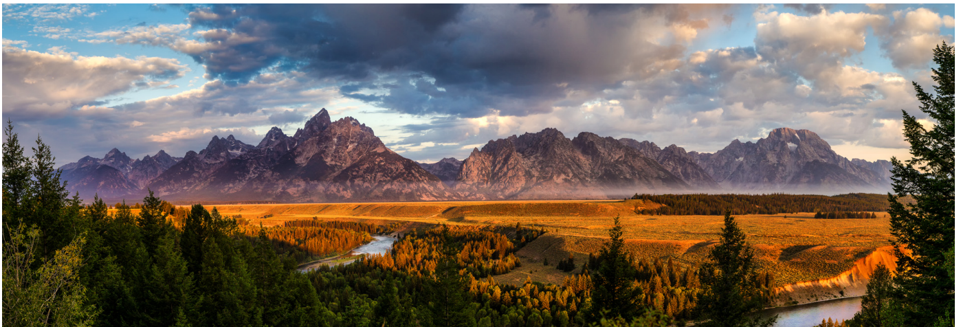
“Silly Face” by Cynthia Gibson

Each Participant can submit up to 4 photos in each category.