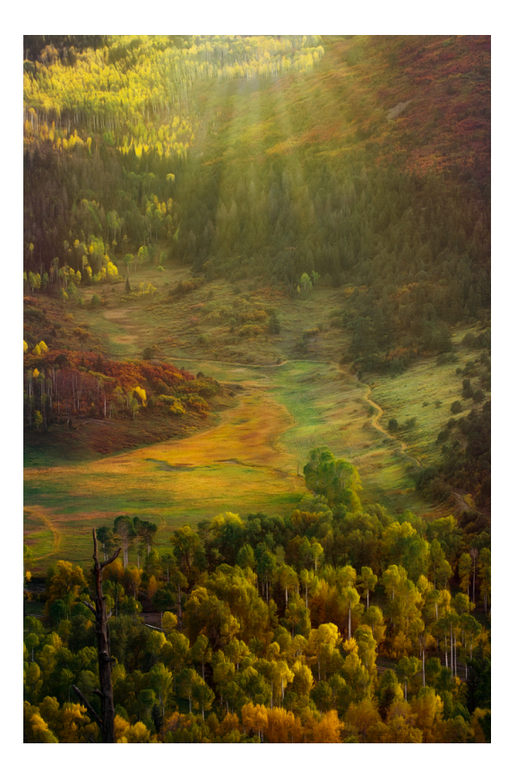
"Autumn Rays" by Debi Boucher

Autumn Rays was made on September 27, 2016 at 5:45 PM on County Road 5, off of Highway 62 outside of Ridgway, Colorado. The location was filled with great photographic opportunities, and few people, so we enjoyed it immensely! The road is also known as the Girl Scout Camp Road. The camp, at the end of County Rd 5, was abandoned by the Girl Scouts in the 90's and rather than let the property go to a private party, the citizens of Ridgway raised funds to purchase it, then turned it over to Ouray County to be used as a public resource.