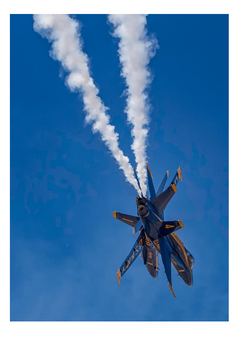
"Passing on Your Right" by Jim Van Namee

Passing on the right. Taken at the 2016 Reno Air Show., midday During a Blue Angels practice flight I set up, hand held, with a 200mm lens, F-8 aperture, 1/2500 shutter speed using Auto ISO and underexposed half a stop.