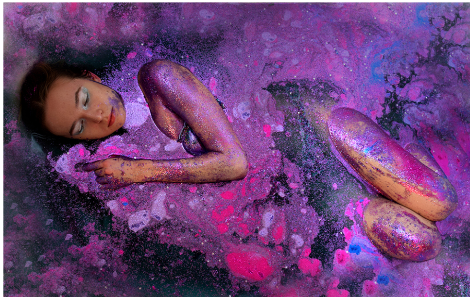
“Bath Tub Dreams” by Natalie Forbes