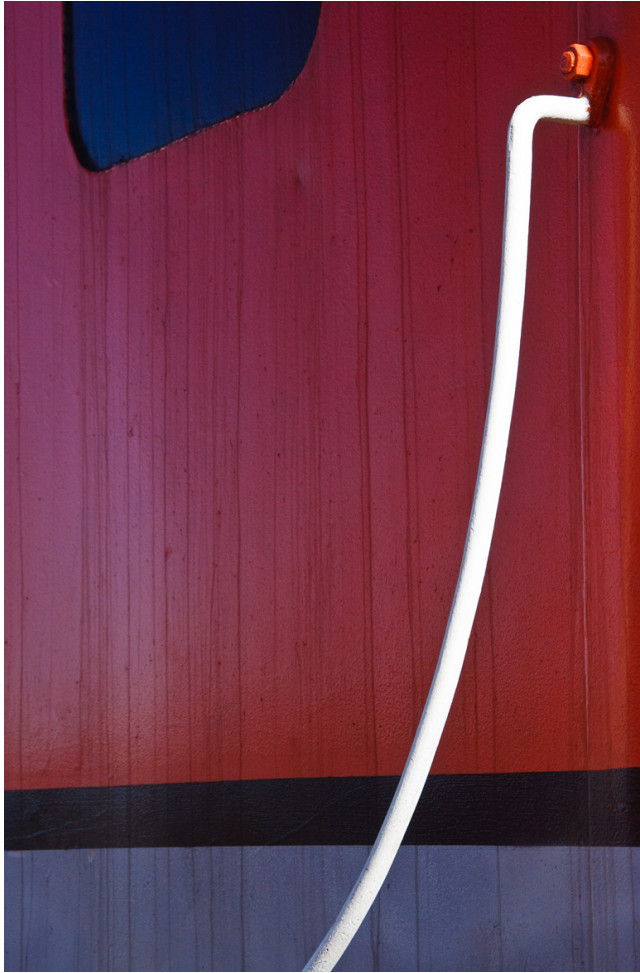
“Caboose Grab Iron” by Bruce du Fresne

Down at the old Denver & Rio Grande Western depot, more recently known as Giuseppe’s Old Depot restaurant, the Union Pacific keeps a locomotive and a caboose. Or they used to. This photo, made back in ’08, is one of several detail shots of that caboose. It’s still painted in the old Rio Grande colors. It’s nearly mid day and the flat side of the caboose is shaded, only the white handrail is illuminated. I was struck by the nice sweeping curved line contrasting with the other rectangles shapes of color.