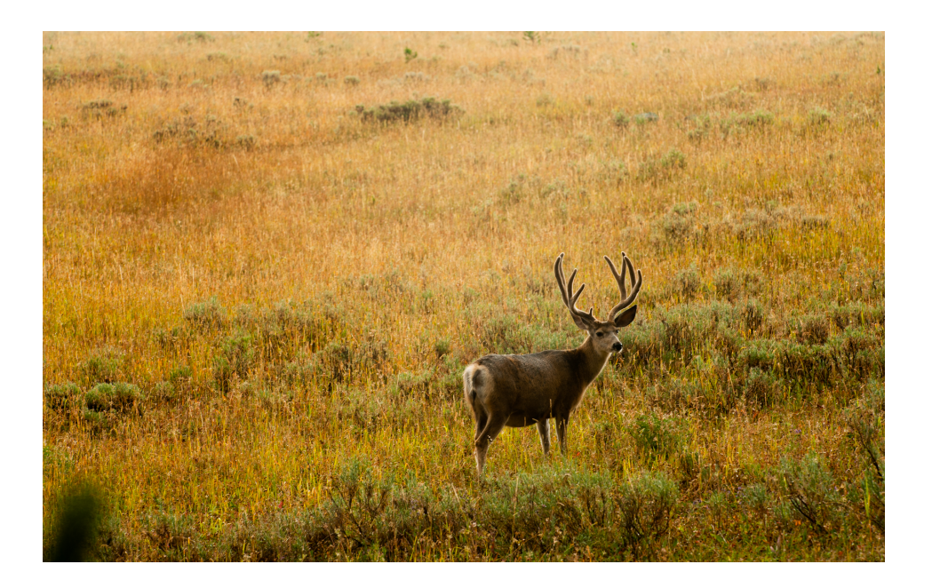
"Lone Deer" by Candee Read"

We were at Yellowstone. This buck was wandering in the meadow. I hid in the trees. I photoed it many times until he gave me this trophy pose.