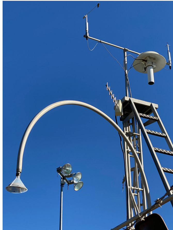
“Modern Conveniences” by Rita Steinhauer